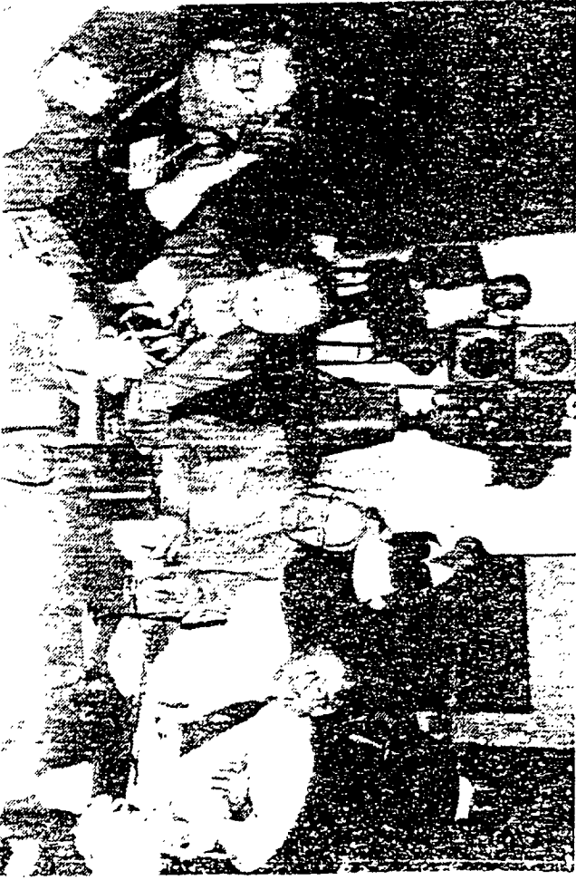
Local Kiwanis members traveled to Detroit recently to celebrate the 75th anniversary of Kiwanis.

three hours of college credit in Physical Education and Hygiene A 1989 graduate of St. Johns High School, he joined the Navy in August 1989.